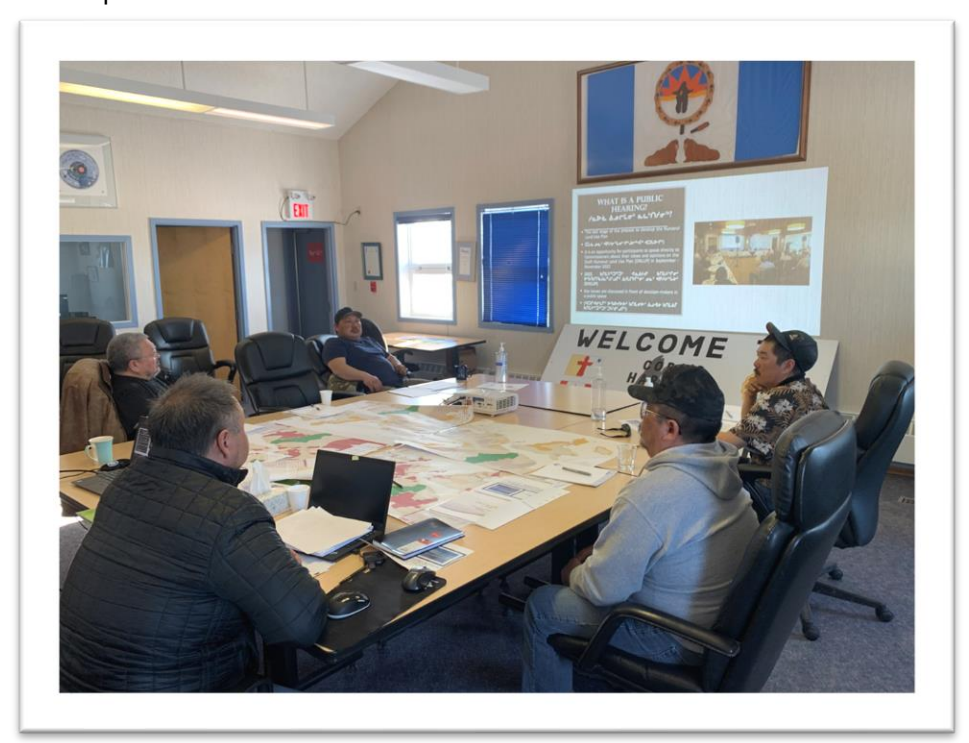
Figure 1: Community members public hearings preparatory session in Coral Harbour

To ensure effective community participation towards the development a Nunavut-wide Land Use Plan, the NPC staff held information sessions with appointed community representatives from the 25 communities in Nunavut, including transboundary groups in Northern Quebec, Northern Saskatchewan and Northern Manitoba between April and November 2022.