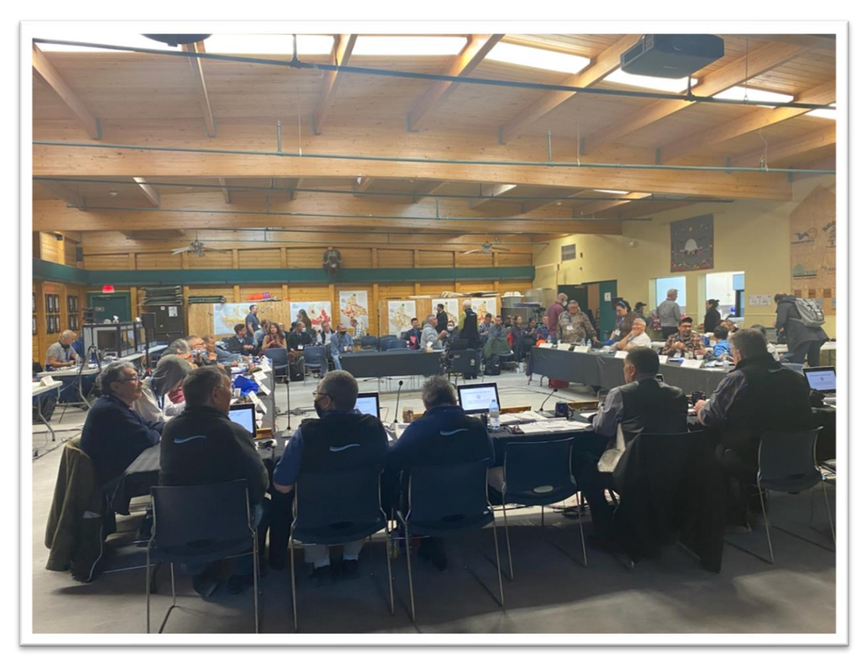
Figure 5: Community Roundtable during the Kitikmeot Public Hearing in Cambridge Bay