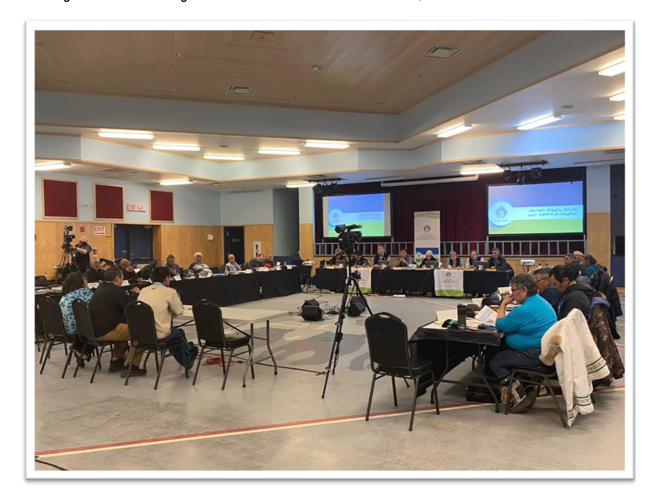
Figure 8: Community Roundtable during the North Baffin Public Hearing in Pond Inlet

The following table summarizes participants' input through presentations and discussion at the – North Baffin Regional Public Hearings held in Pond Inlet from October 24-27, 2022.