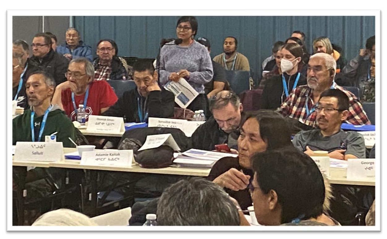
Figure 4: Community Participants during the South Baffin Public Hearing in Iqaluit