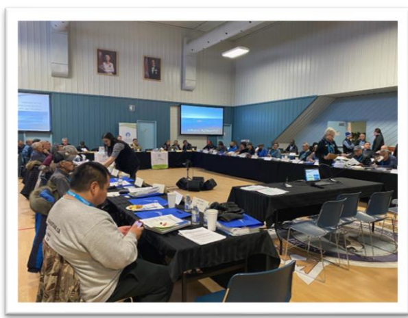
Figure 9: Community Participants during the South Baffin Public Hearing in Iqaluit