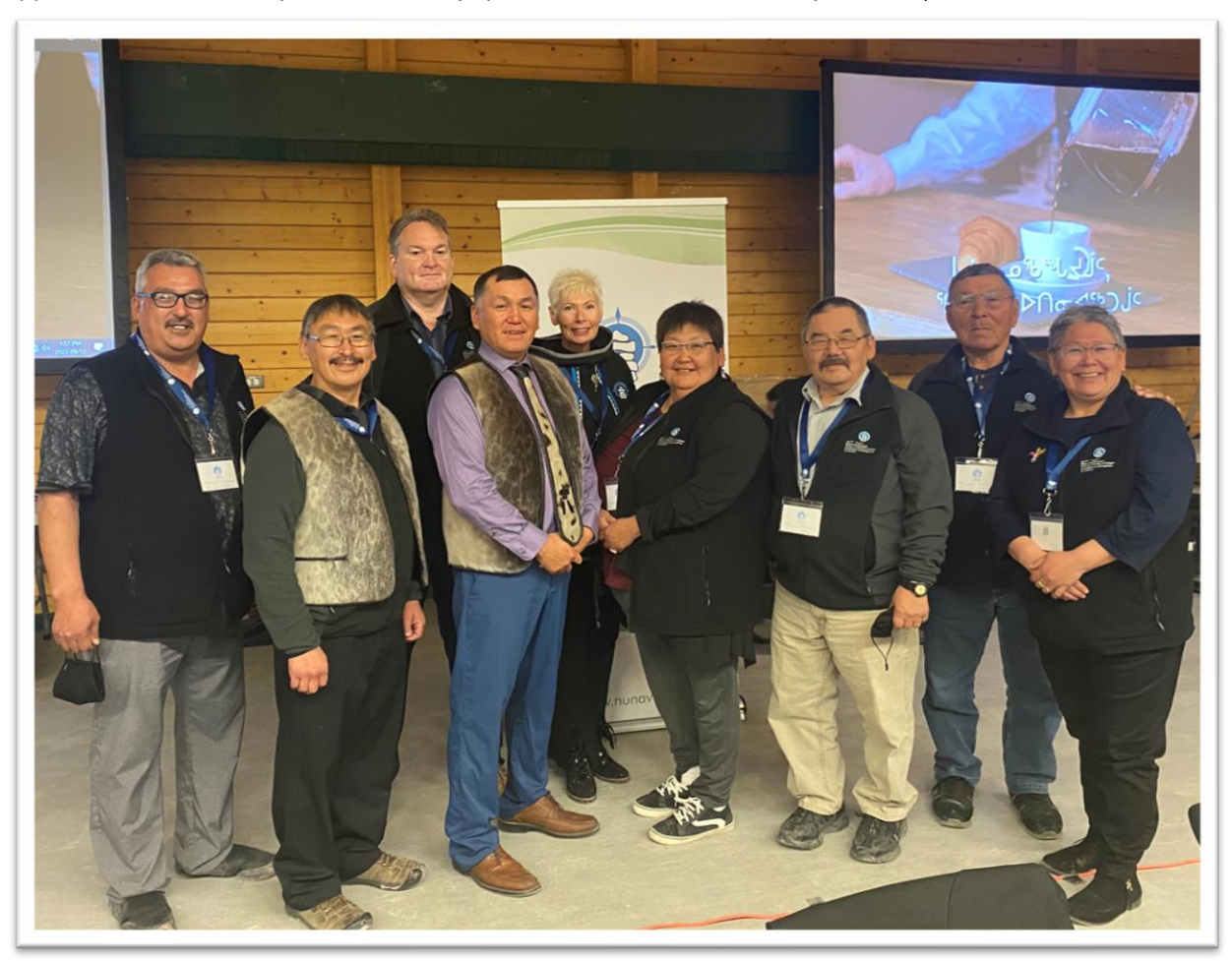
Figure 3: NPC Commissioners and Executive Director at the Public Hearing in Cambridge Bay

Pursuant to Rule 7 of the NPC Rules for Public Proceedings, the Commission made reasonable best efforts to notify communities or potentially interested or affected parties by the Proceedings as much as possible in Inuktitut, English, and French and used various methods to distribute notices. The NPC informed the communities and Participants of the upcoming public hearings through various advertisements including, emails, NPC website notices (www.nunavut.ca), social media postings, print media, radio, and cable advertisements. Newspaper advertisements in English, Inuktitut, and French were printed in the Nunatsiaq Newsprint publication for two (2) weeks prior to the commencement of the NPC Public Hearings. (See <a href="https://example.com/Appendix">Appendix C</a> for an example of the Newspaper advertisement that were published).